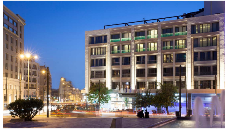
Wyndham Athens Residence - Achilleos 2, 10437 Athens, Greece